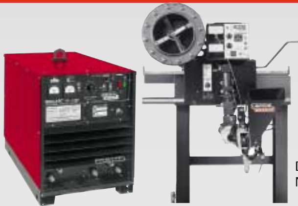
DC1000 with NA3 subarc set